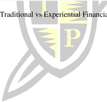
Table I: Traditional vs Experiential Financial Education